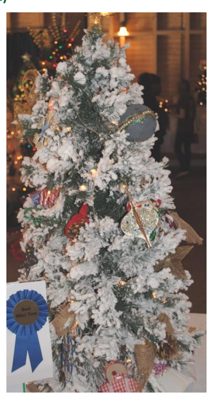
2013 Best Mini Tree Trinity Catholic School

(Note: Maximum height allowed is 6 ½ feet)